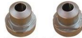
for 3 flutes End Mill for 2 and 4 flutes End Mill Order No. EMG-413-H1 EMG-413-H2