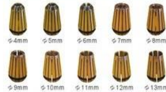
Order No. EMG-413ER