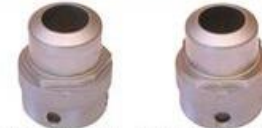
for 3 flutes End Mill for 2 and 4 flutes End Mill Order No. EMG-1225-H1 EMG-1225-H2